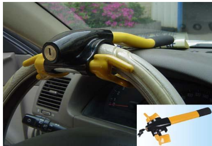
“Steering wheel locking device”